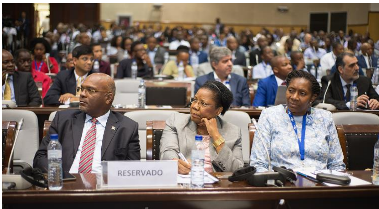
The attention that dominated during the 1st Conference sessions, Maputo November 2018