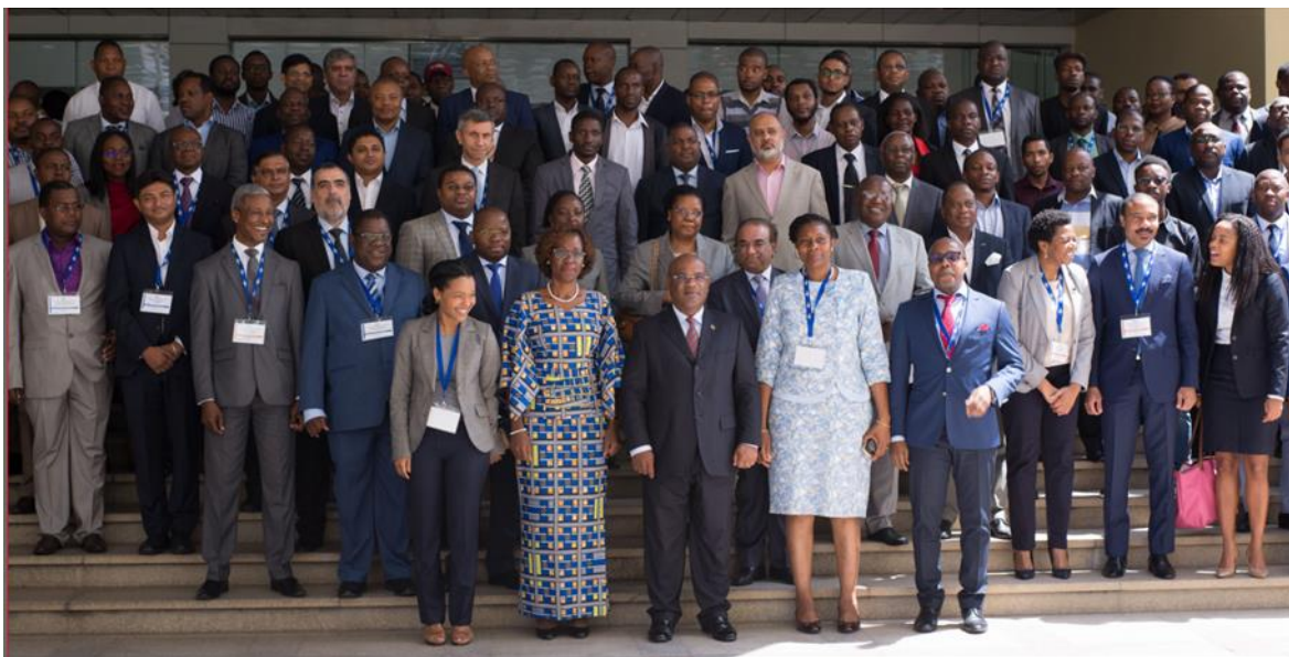
Family Photo of the 1st National Cyber Security Conference, Maputo November 2018

Showing that the concern on this subject is across the nation, the President of the Republic of Mozambique, Filipe Jacinto Nyusi, referred to this theme in the communication he gave during the graduation ceremony in Police Sciences, the following quote: “... Another issue that we would like to draw your attention to is the prevention and fight against cybercrime. This is an atypical reality, but increasingly current and with perverse effects, given its rapid spread and the difficulty of repairing the damage... ”.