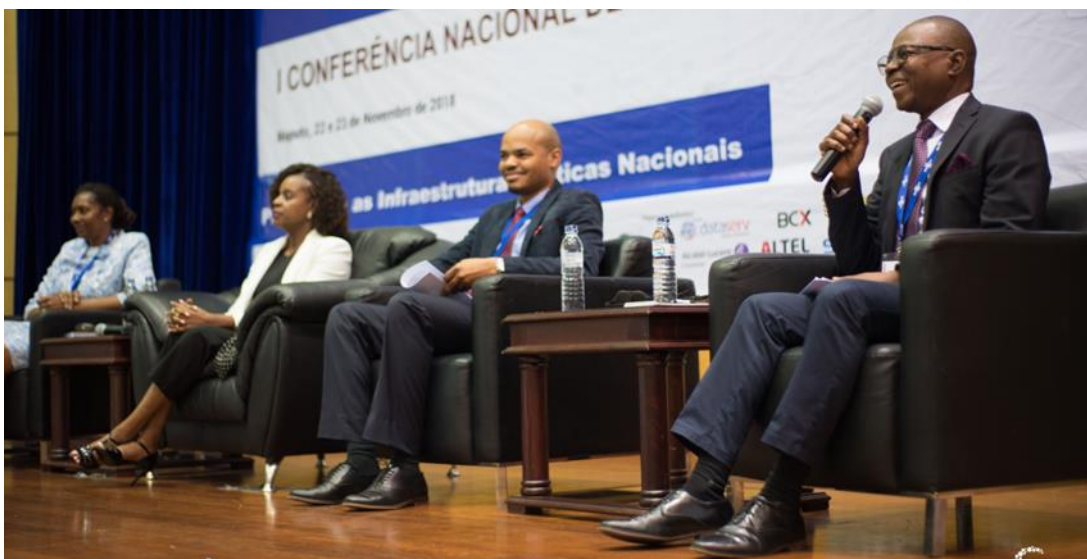
Panel of the 1st National Cyber Security Conference, Maputo November 2018